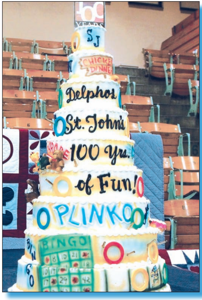
More photos page 6.

money raffle. More than 410 purchased tickets. The parish received more than $11,000 in raffle ticket sales and donations from out of town friends and alumni. Their support was wonderful and so very much appreciated. In total, the Centennial Festival raised $182,249 for St. John's, more than $20,000 over the 2011 total.